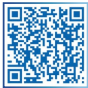
SCAN FOR CONSTRUCTION INFO