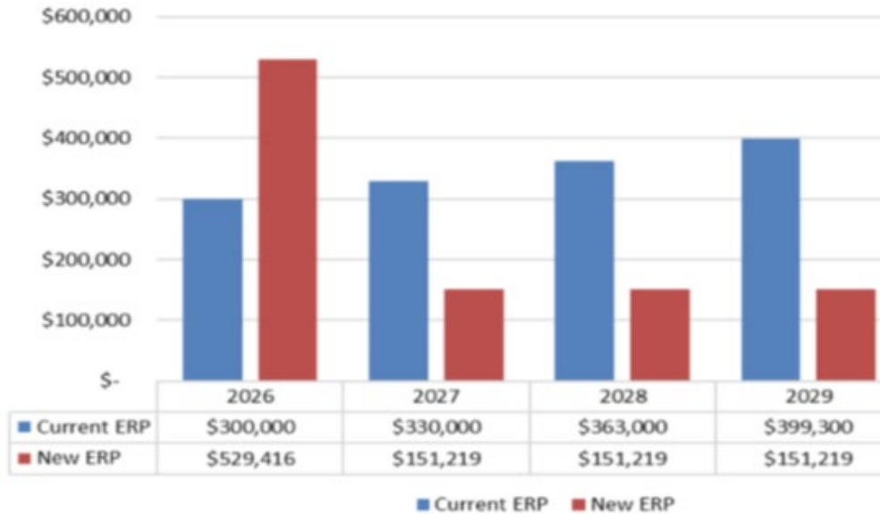
Year Over Year ERP Systems Cost Comparison

Description: This project proposes modernizing the District’s Enterprise Resource Planning (ERP) platforms.